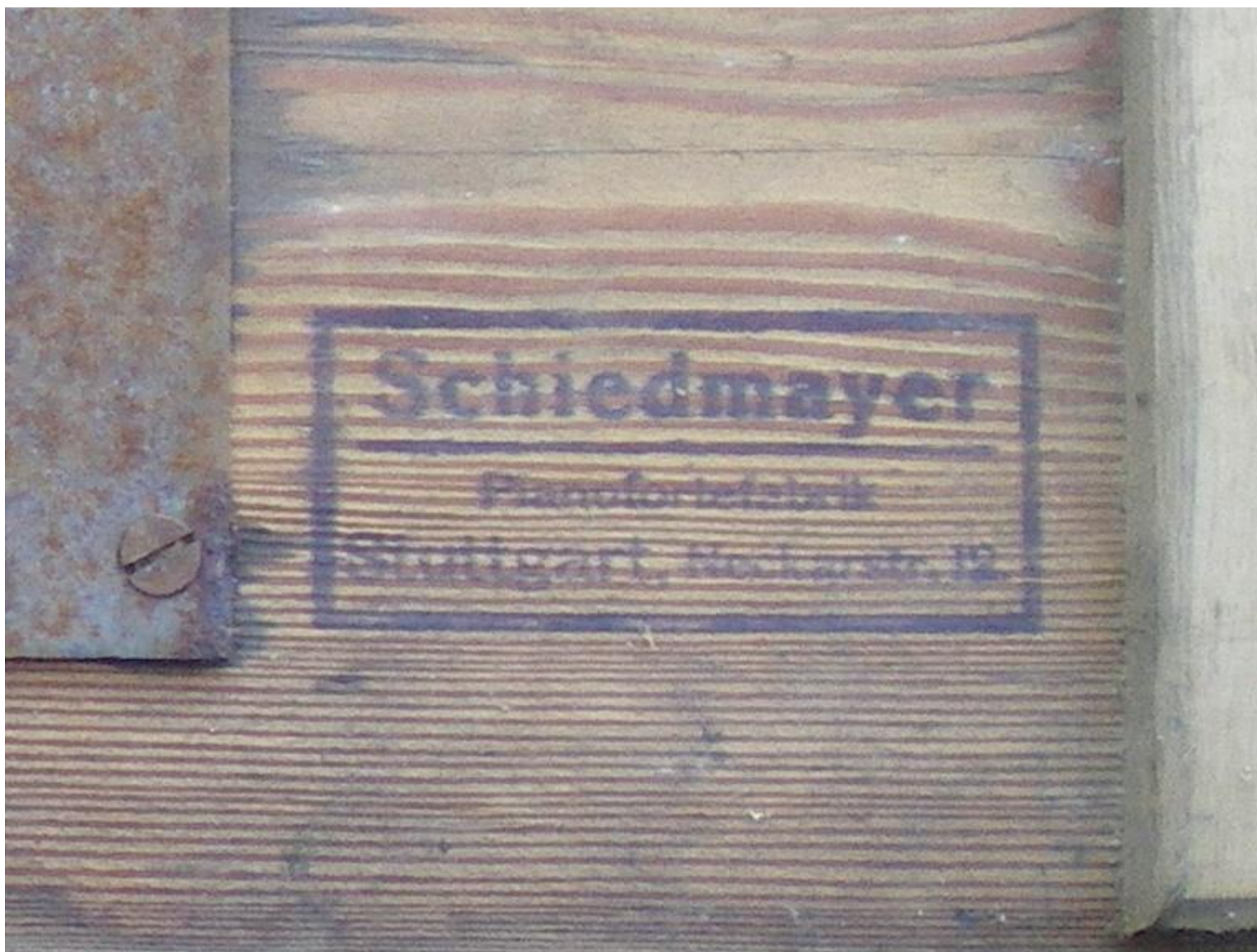
Schiedmayer Pianofortefabrik. The brand still exists http://www.harmoniumnet.nl/schiedmayer-200-years.html