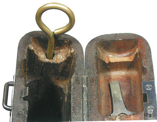
1476. Closeup of the internal loop-handle cleaning rod housing in the 1913 prototype troop trials holster-stock for the LP.08.

Apart from the shaft length, which is 235mm, the standard LP.08 rods closely follow the pattern of the later steel shaft/threaded end Naval rods, initially using brass washers/distance piece for the rotating